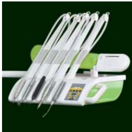
SMILE SYMPATIC E