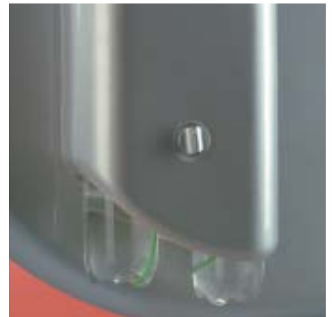
Disinfecting system of water ways and independent circuit of clean water – important option for higher and middle level of SMILE units