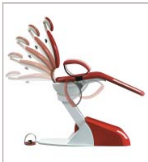
Chair Smile SK1.01