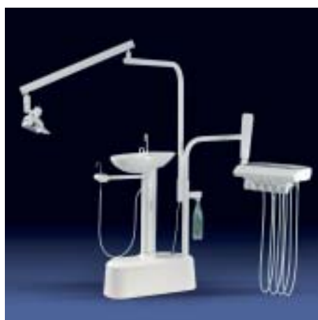
SMILE MINI 02 STATIONARY