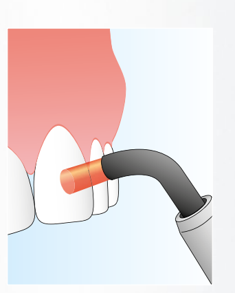
Laser bleaching Flash activation of O<sub>2</sub> radicals, Optimised treatment time, Gentle on the teet, Better results