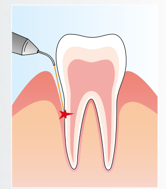
Periodontology Pocket bacterial reduction, Removal of granulation tissue