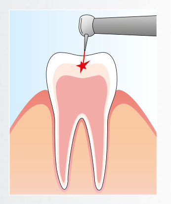
Therapy laser Pain (general), Aphthae, Herpes, Wound treatment, Root irritation suppression, Temporomandibular joint disorders